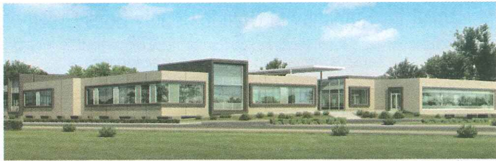
Airport Professional Center rendering.